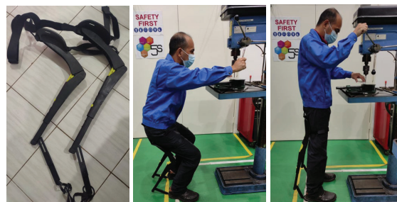
Figure 1 The low cost commercial lower limb

galvanized steel, and aluminium (5052). Additionally, this study had performed a minor design modification on the thigh support of the commercial sit-stand exoskeleton to improve its structural strength. Findings of this study are certainly important for exoskeleton designers to develop a sit-stand exoskeleton that is safe for users.