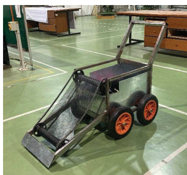
Figure 3 Paddy Seedling Sowing Machine

Figure 3 illustrated the completed assembly of the Paddy Seedling Sowing Machine. Product testing on the actual field could not be executed as preparation of the planting bed for new paddy seedlings may take up a few months and it is highly dependent on the weather.