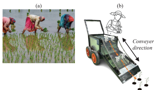
Figure 4 Postural state of farmer (a) before and (b) after using the machine during paddy seedling transplanting

transplanting (Figure 4). Seedlings collections improve as the sprouted seeds are scooped into the conveyer net and transferred into the collection tank using the powered motor without requiring the farmer to squat in an uncomfortable position. Accordingly, seedlings transplanting also improves as the farmer is only required to slot the seedling into the conveyer net in a controlled distancing and transferred it into the planting bed using the powered motor. The use of the net as the conveyer platform is very convenient in filtering out muddy substances from the collecting seedlings. Furthermore, paddy producers can operate in a comfortable position without needing to flex at an awkward angle.