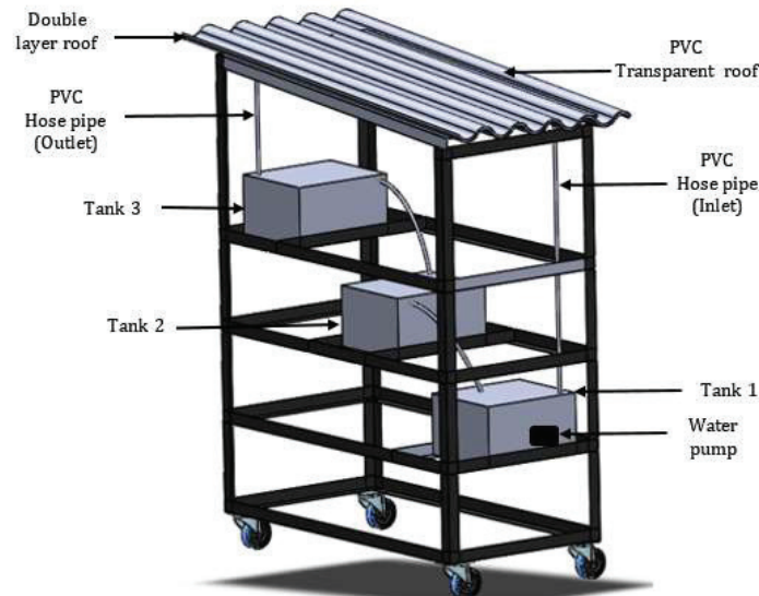
Figure 2: Proposed future prototype of double roof cooling system concept

This design will be formed as an equivalent matching roof of the water that will flow through it. The thermo-fluid cooling process is aided by a continuous flow of water fluid on the double roof. The selection of roof design and materials by using water fluid as a cooling system, a water pump for fluid to cycle for cooling process, and the process to fabricate the roof cooling system. The thermo-fluid concept is based on the exchange of heat from hot to cold water. Water will be recycled and reused in the system's cooling process. The water pump will aid in the flow of water through the roof and into the water-cooling process. Figure 2 depicts the expected double roof cooling system to prove working concept prototype.